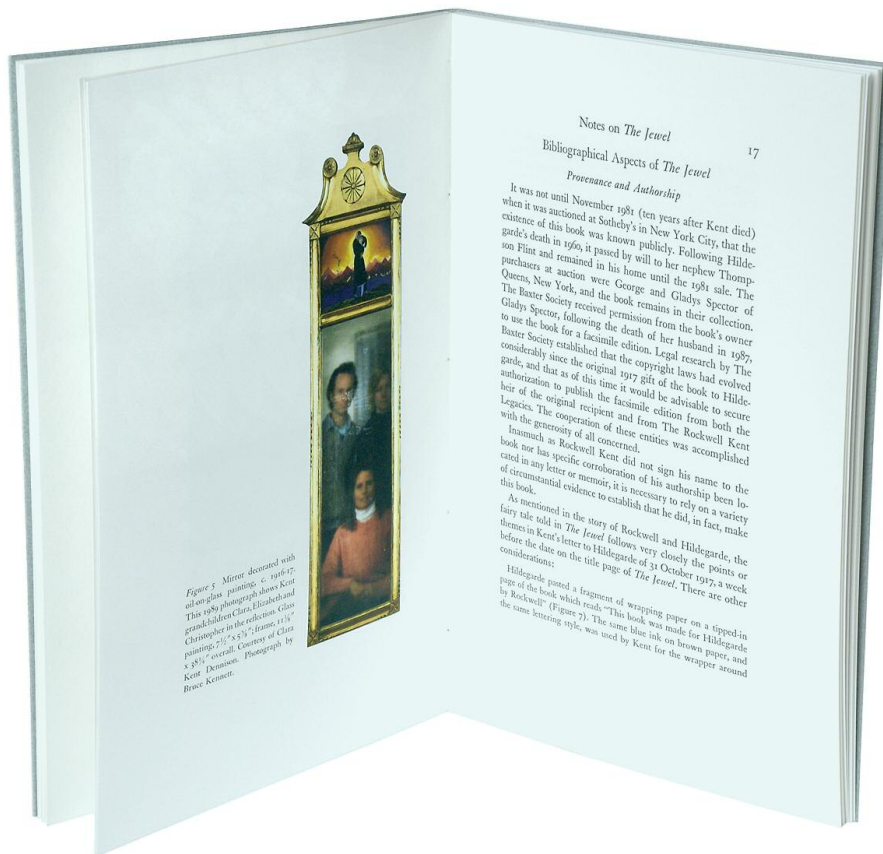
COMPANION BOOKLET WITH ESSAY AND PHOTOGRAPHS